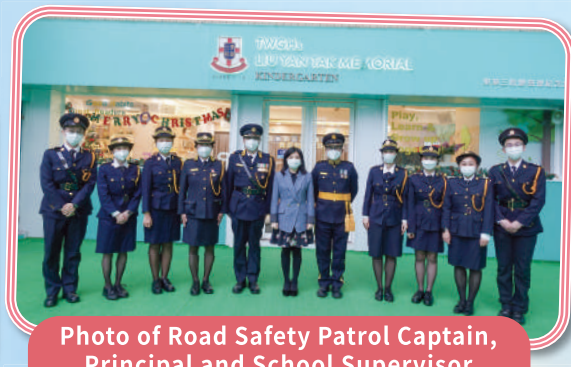
Photo of Road Safety Patrol Captain, Principal and School Supervisor 交安隊長官、校長、學校領隊老師合照