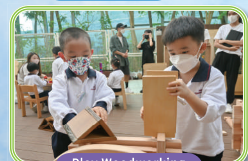
Play Woodworking 「玩木工」