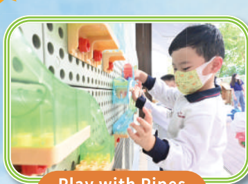
Play with Pipes 「玩管道」