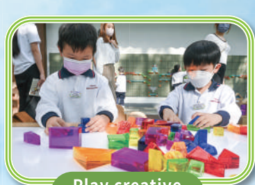
Play creative 「玩創意」