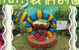
Wheel Sea Animals 車輪海洋動物