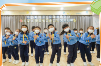
Perform the Happy Bee Song 表演小蜜蜂會歌