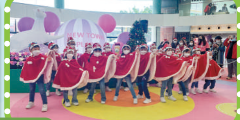
New Town Plaza Christmas Carol Festival 沙田新城市頌歌節