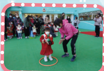
Parent-child competition 親子競技