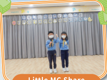
Little MC Share their Feelings 小司儀分享心得