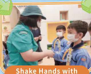
Shake Hands with the Team Supervisors 與隊監握手