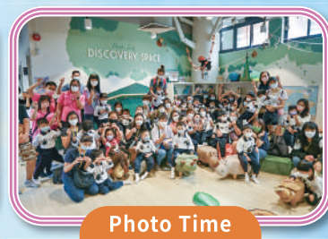
Photo Time 大合照