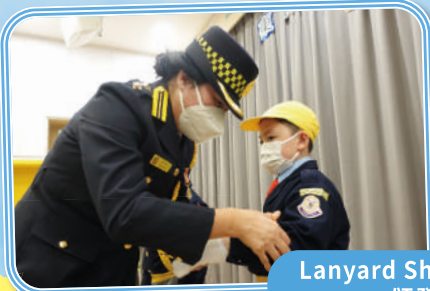
Lanyard Shoulder Cord 頒發笛繩