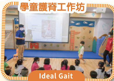
Ideal Gait 理想的步姿