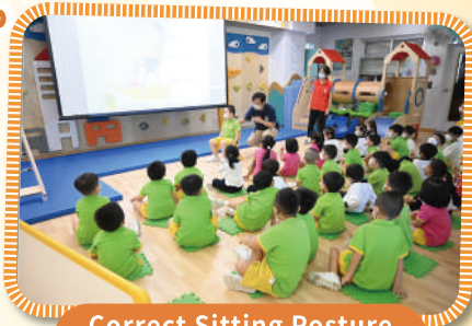
Correct Sitting Posture 正確的坐姿