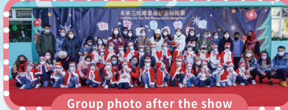
Group photo after the show 匯演大合照