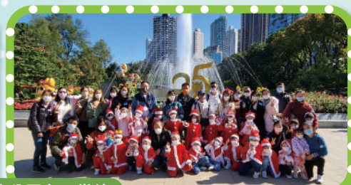
Zoological and botanical Garden Winter Show 動植物園冬日賞繪