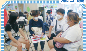
Parents discuss the compression index of the spine together 家長一起討論脊骨的受壓指數