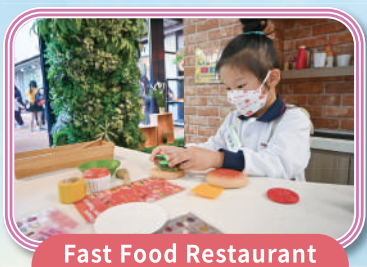
Fast Food Restaurant 快餐店