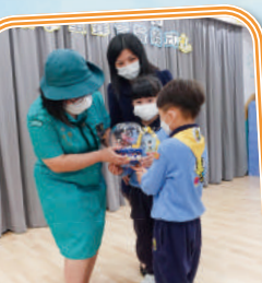
Present a Souvenir to the Team Supervisor 贈送紀念品給隊監