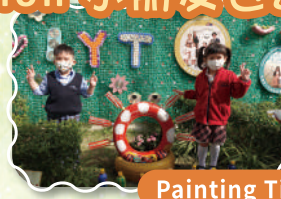
Painting Tires 繪畫車胎