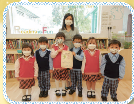
“Hong Kong Green Organization Certification - Energywise Certificate” - Excellent Class 榮獲「香港綠色機構認證——節能證書」之卓越級