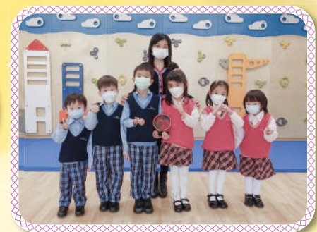
“Opportunities for the Elderly Project (OEP) 2022 short video competition” - Merit Award 榮獲2022「老有所為」短片創作比賽之優異獎