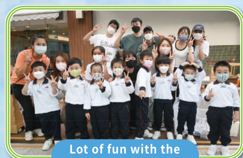
Lot of fun with the prospective teacher~ 和準老師玩得很開心呢