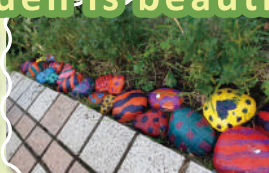
Painted Stone 彩繪石頭