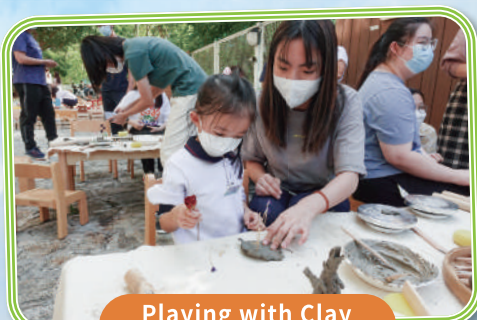
Playing with Clay 「玩陶泥」