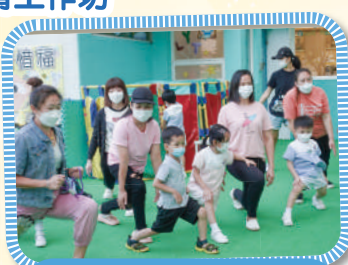
Stretch your legs 壓壓腿

The health of the spine is very important to the growth of children, therefore, our school has participated in the "Straight Up Hong Kong" Chiropractic School Project in these years, and is committed to promote children and parents to pay more attention to the spine health. This year, some spine-related activities were also organized for our children and parents to participate in, such as the parent-child spine care workshop, students' spine care workshop, Students Chiropractic Care Programme, etc., to let everyone know more about the importance of spine health and how to take good care of your spine and develop a right concept of health.