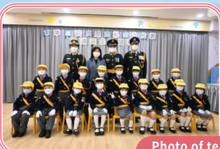
Photo of team members 與隊員們合照