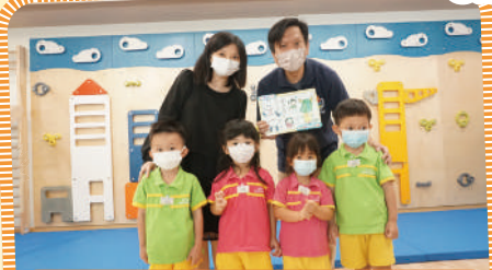
Thank the speaker for his speech 感謝講者的演講