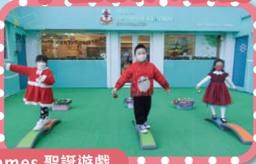
Christmas games 聖誕遊戲