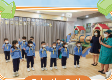
Take the Oath 宣讀誓詞