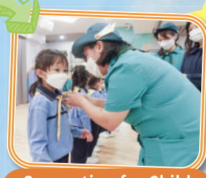
Coronation for Child 為幼兒進行加冕