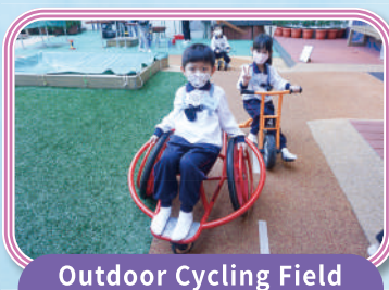
Outdoor Cycling Field 戶外單車場