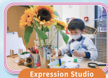
Expression Studio 療愈藝術空間