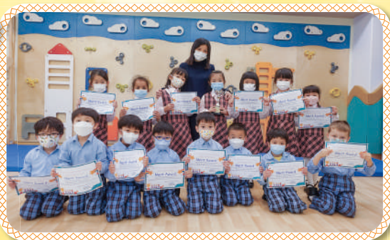
“2023 Hong Kong Children's English Singing Competition Sha Tin District Trial” - Merit Award 榮獲「2023全港幼兒英文歌唱比賽沙田區選拔賽」之優異獎