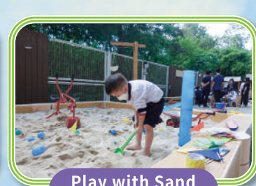
Play with Sand 「玩沙堆」