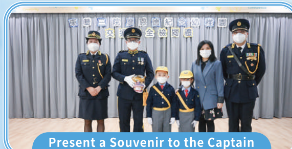
Present a Souvenir to the Captain 贈送紀念品給長官