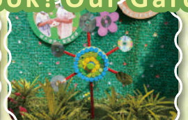
CD Scarecrow 光碟稻草人