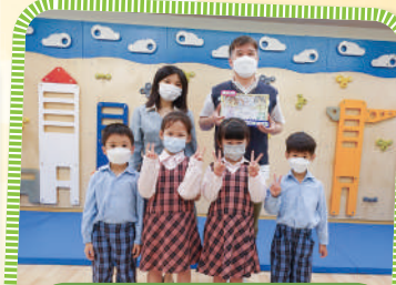
Present a souvenir to the chiropractor to thank him for help 致送紀念品予脊醫，感謝他的幫忙