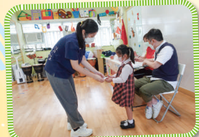
Children receive positive feedback after completing the check 完成檢查後，幼兒獲得正面的回饋