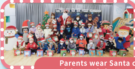
Parents wear Santa costumes to celebrate Christmas with children 家長穿上聖誕老人服飾與幼兒一同慶祝聖誕