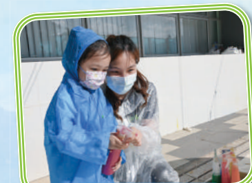
Play with Water 「玩水樂」